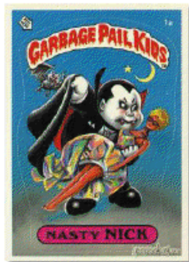
Original Series (1985-1988)