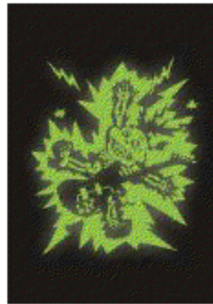
Glow in the Dark