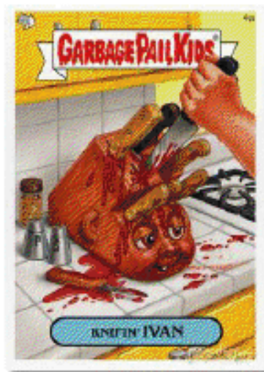
All New Series (2003-2007)